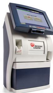
Bioreactor Media Health Vi-CELL MetaFLEX