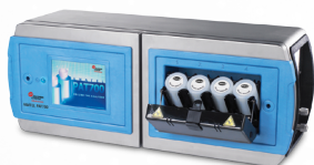
Total Organic Carbon and Conductivity PAT 700