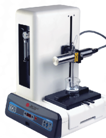
HIAC Final Product Particle Pass/Fail Test HIAC 9703+