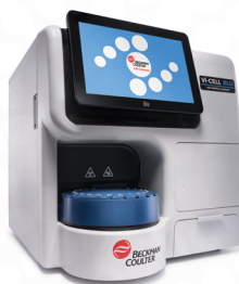
Cell Viability and Concentration Vi-CELL BLU