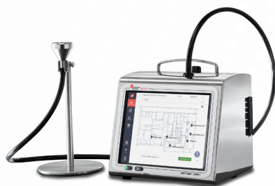
Cleanroom Air Particle Counting MET ONE 3400+

Let us help you automate processes and reduce the potential for human errors by eliminating pass/fail calculations, manual data entry and paper records.