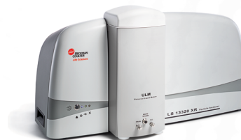
Laser Diffraction Particle Size Distribution LS 13 320 XR