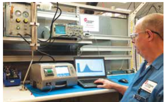
The CoreCAL system is exclusive to Beckman Coulter service engineers and authorized agents.