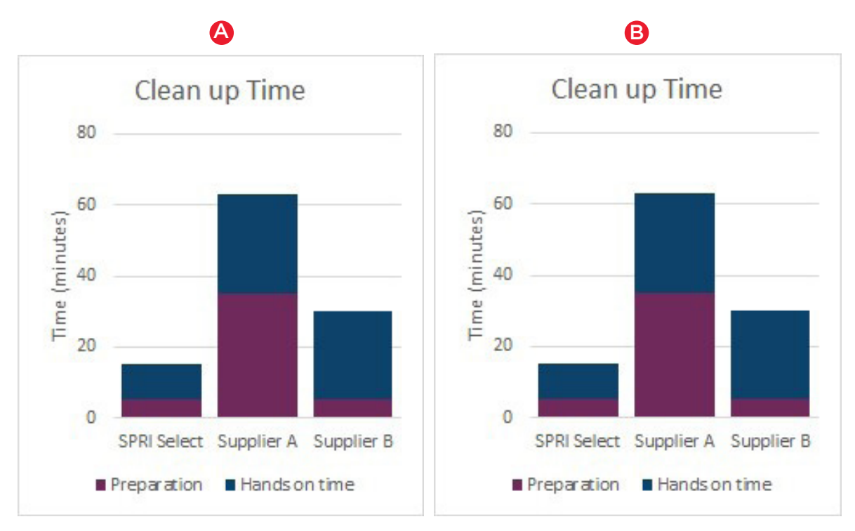
Figure 3. SPRISelect and two other commercially available kits were used for size selection on sheared gDNA from E. coli. (Left) The graph represents the time for single size selection or clean up. The SPRISelect workflow for a single size selection is 4.2 and 2 times faster than supplier A and supplier B, respectively. (Right) The graph represents the time for dual size selection. The SPRISelect workflow for dual size selection is 3.8 and 2 times faster than supplier A and supplier B, respectively. SPRISelect has the lowest processing time out of all three suppliers by at least 50%. The times were based on performing size selection for 8 samples manually.