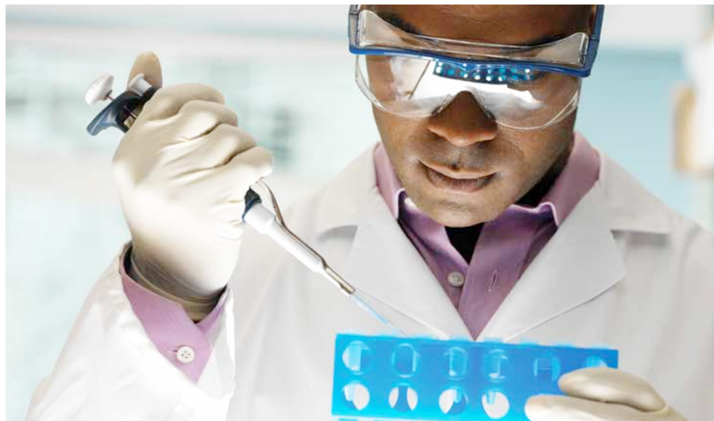
Save time and reduce the potential for human errors from manual cocktailing.

With our flexible, collaborative approach, small lot size requirements, and waste-reducing DURA Innovations-based dry reagents, we can help you do more, save more and achieve more.