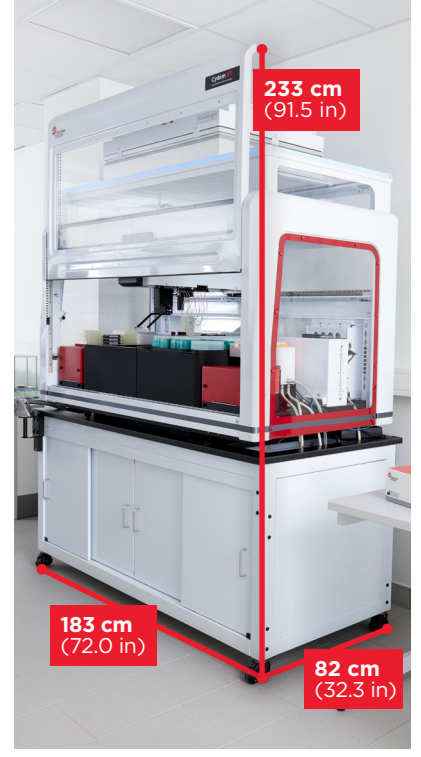
Cydem VT system dimensions