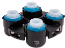
VS 4.750 BIOC

4 x 750 mL Swinging-Bucket Rotor with several configurations. Easily exchange buckets for microplate carriers or hexagonal carriers.