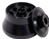
VFC 8.50 BIOC

24 x 15 mL conical tubes Max speed: 11,431 x g (9,000 rpm)