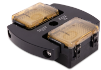
VS 2.5-96 BIOC

4 x 25 x 10 mL hexagonal bucket rotor Max speed 240V / 120V: 4,478 x g (4,700 rpm) / 3,748 x g (4,300 rpm)