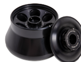
VF 6.94 BIOC

8 x 50 mL conical tube rotor with BioSafe Lid Max speed: 15,032 x g (11,360 rpm)