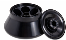
VF 6.250 BIOC

6 x 94 mL tube rotor with Biosafe lid Max speed: 11,872 x g (10,000 rpm)