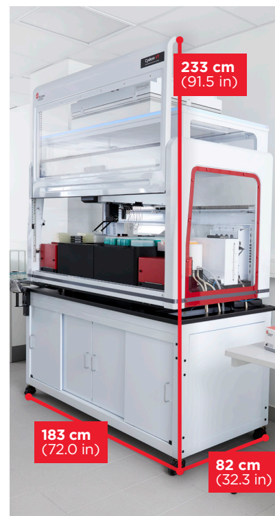
Cydem VT system dimensions