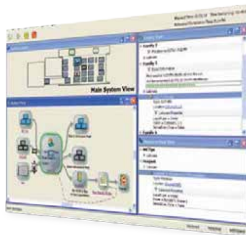
Our SAMI Workstation EX software displays a view of the method, depicts labware movement, and allows device failures to be tracked and addressed through SAMI EX Runtime.

Beckman Coulter also provides data management software that you can rely on. Our software solutions allow you to easily access and generate reports about your runs, labware, and samples any time. Data is seamlessly transferred between methods so there is no need to read intermediate text files, and the software can also use your data to make decisions within your workflow. Additionally, the software can serve as a direct data source for external information tracking systems and Laboratory Information Management System (LIMS). This provides a data pathway free of human interaction for the most reliable reporting to enterprise data systems.