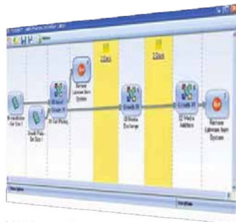
SAMI Process Management software facilitates the planning of complex, multi-day automation workflows.