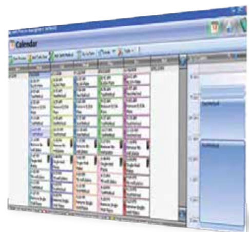
A calendar-like view provided in SAMI Process Management assists in the organization of tasks to be run on the system.