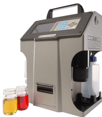
Figure 1. New HIAC PODS+

The NEW HIAC PODS+ now includes an integrated internal pump that replaces the need for CO 2 cartridges and optimizes the portability and degassing capability of this instrument! This new feature enables virtually unlimited “in the field” sampling and improved functionality due to optimizing the bubble degassing process.