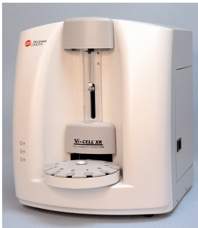
FIGURE 1. The Beckman Coulter Vi-Cell.

grayscale goes from 0 (black) to 255 (white). The stained, nonviable cells appear darker and thus have lower grayscale values. Those cells with higher grayscale values are considered viable. The Vi-Cell camera image screen shows real-time images of the cell population (Figure 2). Up to 100 images may be viewed and archived for future reanalyses.