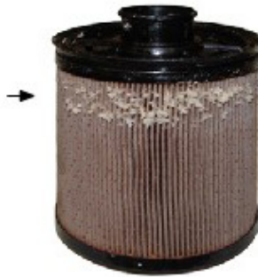
Figure 2. Filter damage