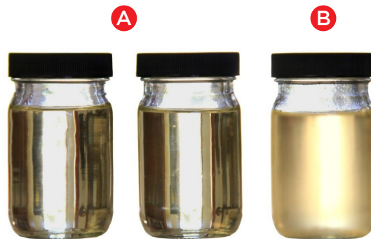
Figure 4. A) One bottle is contaminated, can you tell which one? B) Contaminated.

The human eye is not capable of seeing particles smaller than ~40 μm, roughly the diameter of human hair or dust you see floating in a room when sunlight beams in. Ironically most fuel filter manufacturers sell filters that are rated below 40 μm (5) . It is very clear, pun intended, that there is a problem with this test method. If a human eyeball can only see down to 40 μm and the fuel filter industry manufacturers filters rated below 40 μm, doesn't that prove that particles smaller than 40 μm can create catastrophic damage to machinery and are not detectable with the human eye?