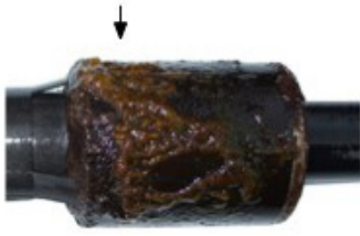
Figure 1. Microbial growth damage