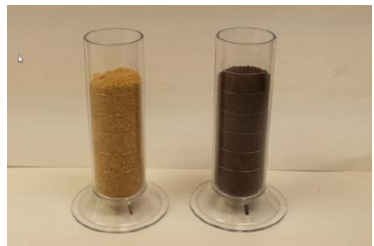
Figure 2 - LS13320 sample vials - Sample amount is typically 35cc