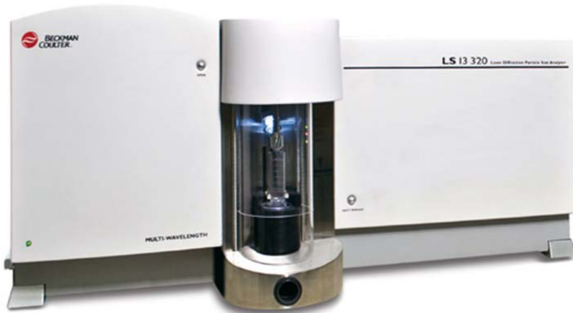
Figure 4 – LS 13 320 with Tornado Module