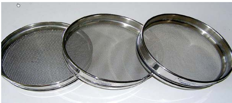
Figure 1 - Sieve Pans - Minimum sample amount is typically 100 grams