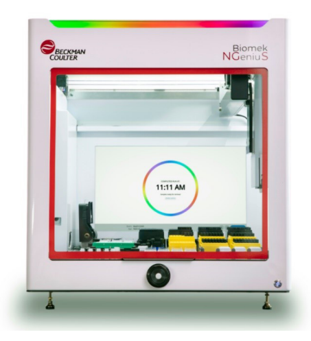
Figure 8. Biomek NGeniuS 360° Multicolor Light Bar on top.