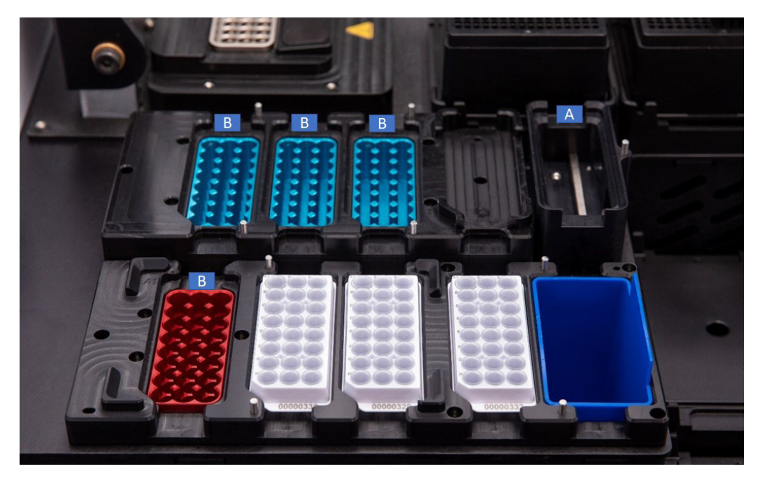
Figure 7. Biomek NGeniuS deck with magnet station (A) and reagent storage zones (B)

Both instrument protocols carry out the magnetic bead-based cleanup step with tip-mixing. The traditional liquid handler requires a separate magnetic plate for bead separation. In contrast, the Biomek NGeniuS Next Generation Library Prep System has an integrated magnetic station on the deck, eliminating the need to purchase additional labware (Figure 7). Due to the high volumes associated with cleanup, the traditional automation protocol requires a deep-well plate for cleanups. On the other hand, the Biomek NGeniuS RV handles up to 600 \mu L and is therefore suitable for cleanup steps.