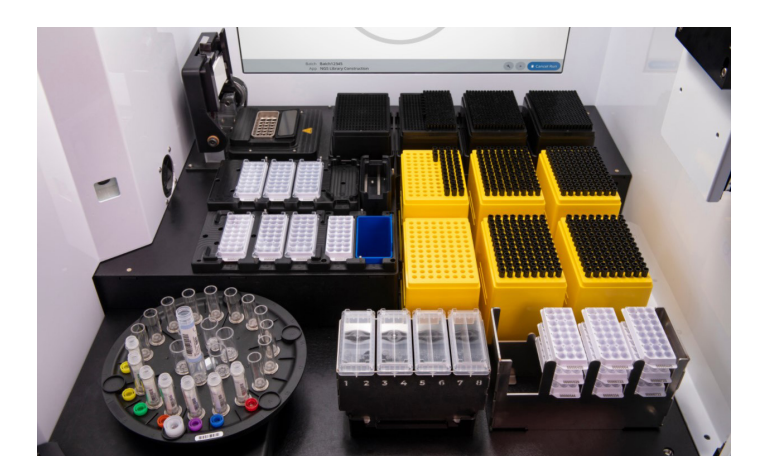
Figure 6. Biomek NGeniuS deck with thermal cycler.

Both liquid handlers automate the end-repair and A-tailing reaction setup with tip-mixing. The traditional liquid handler requires integration of a thermal cycler to carry out the incubation reaction. In the absence of the integration, the user must take the plate out, perform the reaction in a separate thermal cycler and bring the plate back to the liquid handler for the next step. This requires user-intervention and significant hands-on time. With the Biomek NGeniuS system, the End Repair and A-Tailing incubation is performed in the built-in thermocycler and labware transport system (Gripper; Figure 6). This increases walk-away time and minimizes manual interactions with the liquid handler.