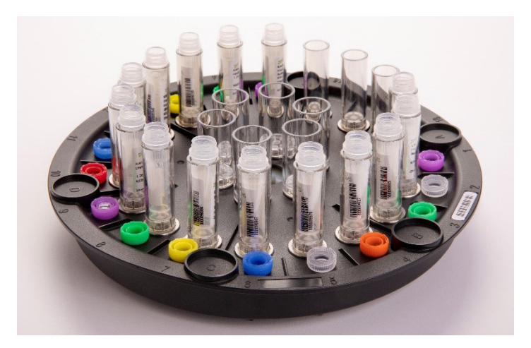
Figure 4. Biomek NGeniuS reagent input carousel can take many of the industry tubes including 0.5 mL, 5 mL.

In comparison, the Biomek NGeniuS Next Generation Library Prep System protocol eliminates these unnecessary pipetting steps by having the user place original reagent tubes on the reagent input carousel (Figure 4). The carousel is compatible with many of the industry tubes, thus reducing the need to transfer reagents to plates. With its advanced optical character recognition technology, the system can automatically identify which reagents are loaded on the carousel and which required tubes are missing (with or without barcodes). It minimizes waste from under-utilization of plated reagents and gives the flexibility to run any batch size from 4 - 24 samples. The Biomek NGeniuS 8 channel LLS (Liquid Level Sensing) pipetting pod detects insufficient reagents prior to the run. Temperature-sensitive reagents are placed in the Biomek NGeniuS cold storage area (2-65 °C). This does not require additional hardware purchases.