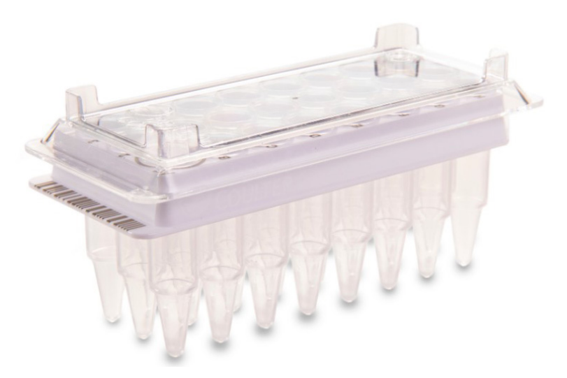
Figure 3. Biomek NGeniuS multi-purpose Reaction Vessel (RV) with 600 \mu L well volume with lid.

Both instrument protocols require manual aliquoting of sheared DNA into automation-friendly labware. Even if the user is running 24 samples, traditional liquid handlers require a 96-well sample plate for sample input. In contrast, Biomek NGeniuS system uses a 24-well Reaction Vessel (RV) as the input plate (Figure 3). The RV serves as a sample input plate with up to 100 million unique barcodes for positive ID of samples. A typical NGS method is labware heavy, requiring at least 3 different plate types (e.g., sample input plate containing nucleic acid samples, PCR plate for thermal cycling and a deep-well plate for cleanup). The Biomek NGeniuS Reaction Vessel replaces all three of these plate types, reducing the need to manage multiple consumable inventories, saving time and money.