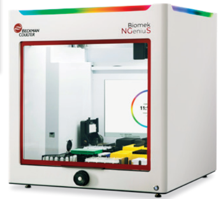
Figure 1b. Biomek NGeniusS next generation library prep system.