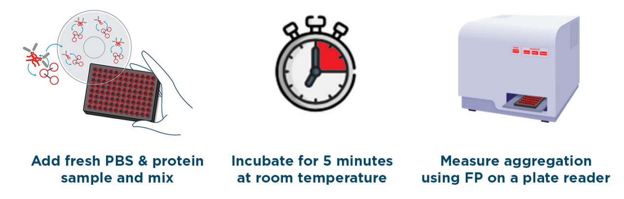
Figure 2. The Valita Aggregation Pure assay workflow. User adds buffer ( 60 \mu L ) and sample ( 60 \mu L ) to the assay plate and mixes. Following a 5-minute incubation at room temperature (RT) protected from light, the plate is read using a fluorescence polarization-enabled plate reader and results are obtained.

While other technologies that are used to measure aggregation typically have lengthy and complex workflows, the Valita Aggregation Pure assay was developed with speed and simplicity in mind. The Valita Aggregation Pure assay has a simple, 3-step, add-mix-read workflow (figure 2) . With no wash steps required and a single 5-minute incubation step, users can generate aggregation data for 96 samples in as little as 15 minutes, representing a significant time-saver versus many other technologies on the market.