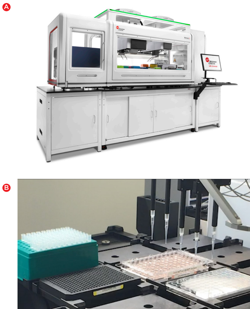
Figure 2. Automated hit picking. A) Biomek i7 with HEPA filters and integrated devices utilized for cell line development. B) Media from the ~15% of wells with colony growth from a single cell were sampled using the Span-8 pipettors and transferred to a black 384-well Tilted Well Plate for analysis on the Octet HTX (Pall Forte Bio).

We utilized the Span-8 pod of a Biomek i7 (Figure 2A) to rapidly sample the media from the primary hit wells across four 96-well plates. The transfers were directly driven by the imported confluence data and the spanning capability enabled the simultaneous sampling of multiple spaced wells per column to accelerate the process (Figure 2B). In addition, the fine level of pipetting control allowed slow aspirate speeds and optimal tip location to avoid disrupting the loosely adherent cells. The Span-8 pod dispensed replicate wells for each primary hit well into a single black 384-well plate – a challenging labware to execute a reformatting process with manually. This plate was then analyzed on an Octet HTX (Pall Forte Bio) to determine IgG titers.