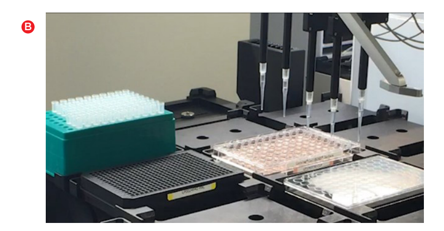
Figure 2. Automated hit picking. A) Biomek i7 with HEPA filters and integrated devices utilized for cell line development. B) Media from the -15% of wells with colony growth from a single cell were sampled using the Span-8 pipettors and transferred to a black 384-well Tilted Well Plate for analysis on the Octet HTX (Pall Forte Bio).

As challenging as the physical aspects of hit picking are, ensuring data integrity during a reformatting process is just as essential. In this example, data that is generated on the 384-well assay plate must be correctly attributed to the source wells to drive a second hit picking step. During liquid transfers, Biomek can automatically transfer the source well information (e.g. location) to the assay plate. This allows the complementary DART data software to automatically copy the assay data from the 384-well plate back to the source plates and wells (Figure 3A), thereby preventing data loss or copy/paste errors. Not only does DART provide an easily-accessible database for all screen data (Figure 3B), but the data can be used to drive the second hit picking step of transferring high-expressing cells into larger well plates for expansion ("secondary hits"). The source of the clone (such as the bar code and well) or the clone tracking ID can also be moved as the cells are moved so that the final plate will have traceable information back to the cell's origin.